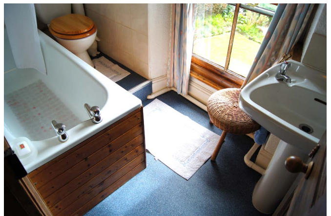
Double - Bath & Shower

The south facing garden, outdoor seating and barbeque can be used anytime. Wireless internet is available on request. Short, medium or long stays, for leisure or work, are welcome. Capel Dewi Community Shop is nearby and guests are welcome to attend village events.